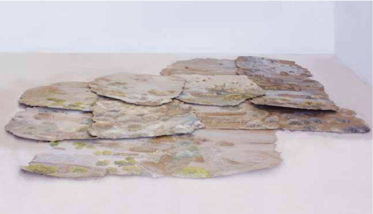
Desert/Floor , 2011, casein on cardboard, dimensions variable. Work in progress. Detail of this work on back cover.