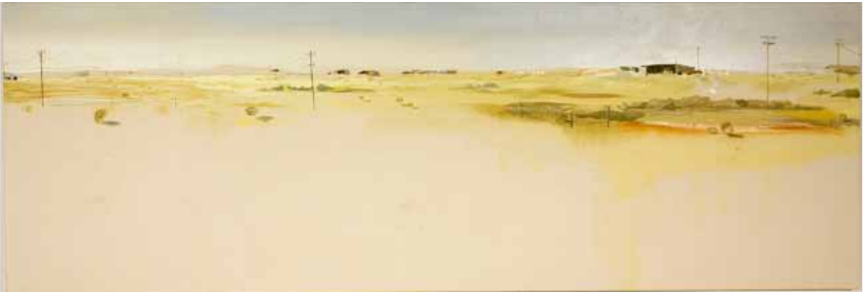
Above: Around , panel #2 of 6, 2011, oil on canvas, 24 x 432 inches in total.