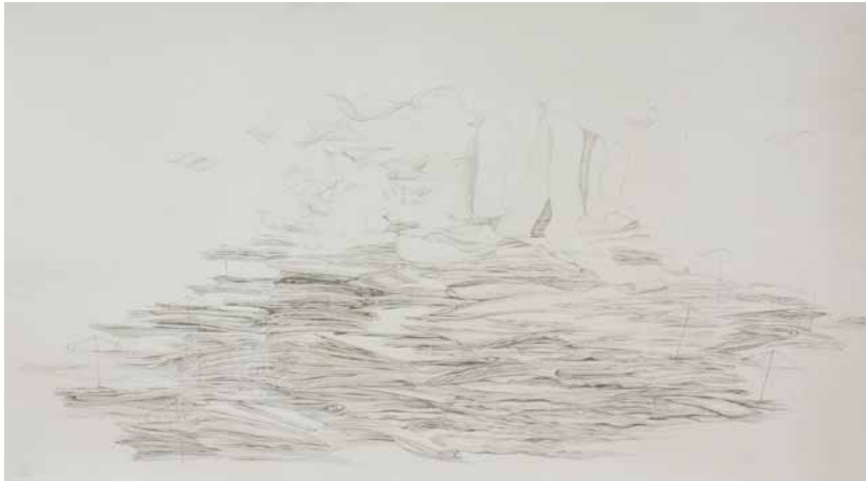
Paper Landscape , 2011, silverpoint, copperpoint, absorbent ground and gesso on paper; 16 x 22 inches. Detail of this work on back cover.