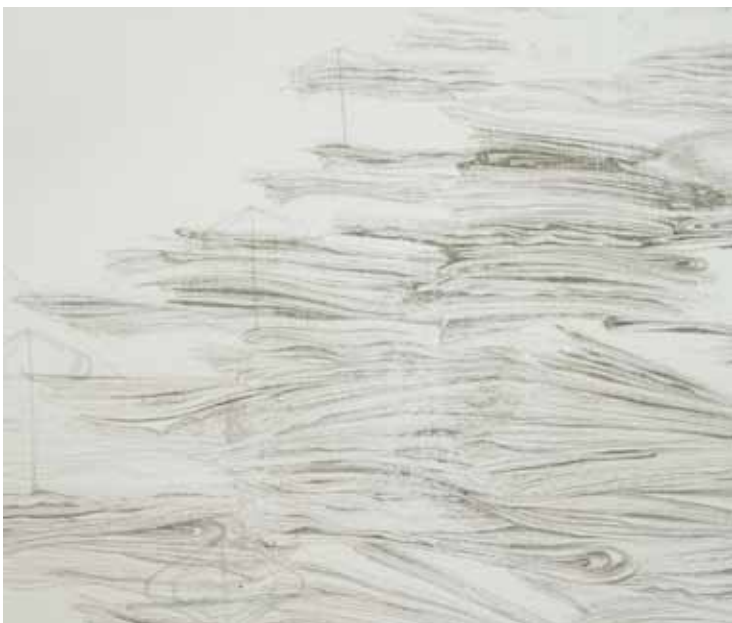
Detail: Paper Landscape , 2011, silverpoint, copperpoint, absorbent ground and gesso on paper, 16 x 22 inches.