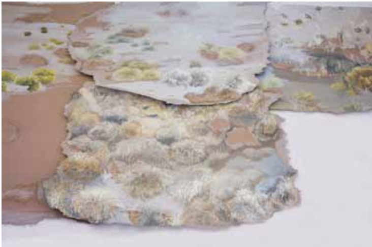
Detail: Desert/Floor , 2011, casein on cardboard, dimensions variable. Work in progress.