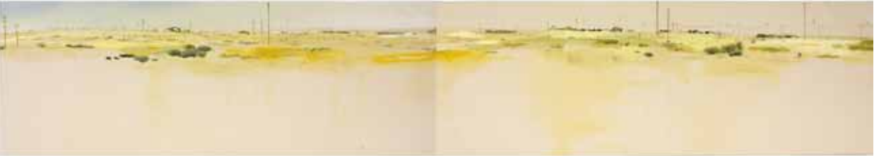
Below: Around , panels #4 and #5 of 6, 2011, oil on canvas, 24 x 432 inches in total.